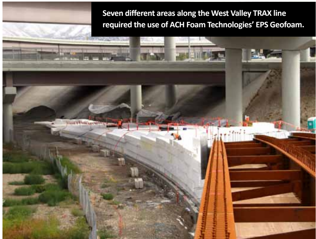
Seven different areas along the West Valley TRAX line required the use of ACH Foam Technologies' EPS Geofoam.

Geofoam can be used as an embankment fill to reduce loads on underlying soils or to build highways quickly without staged construction.